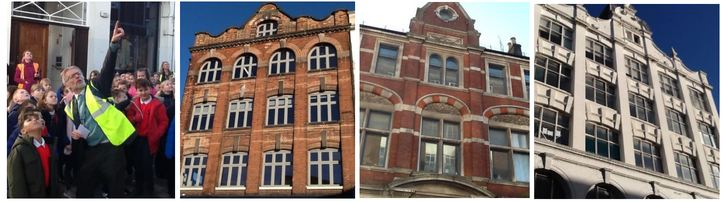
On the same day, they visited Wardown Park museum to learn more about our local history !

In History, Year 4 children have been learning about the history of our town. They have studied the hat making industry and went to visit the Hat District in the town centre to see where the hats were made.